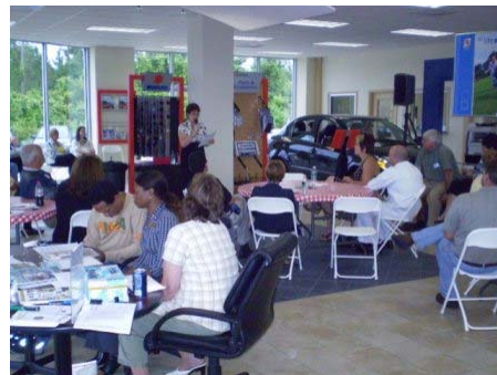
Everyone was eyeing that car!