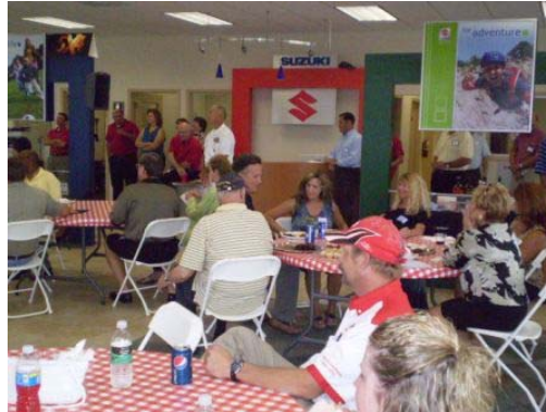
Bennett Suzuki site of May BAH

located at 860-C Kings Bay Road, St. Marys on Thursday, June 18th from 5-7 pm. The theme is New York...Join us for great networking, food and fun!