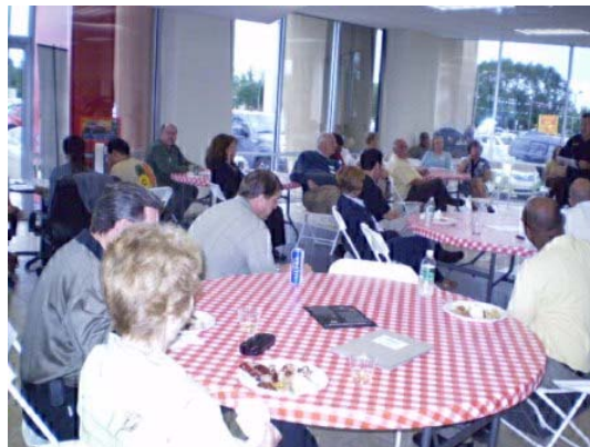
Members enjoying fellowship, food and drinks